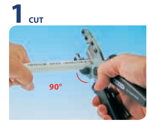
Always cut the pipe squarely at 90°.

You only need to follow three steps for a fast and reliable connection, in combination with the Henco PE-Xc/AL/PE-Xc multilayer pipe.