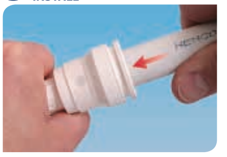
Remove the black protective cap and insert the tube into the fitting until you can see the colour of the pipe through the inspection windows.