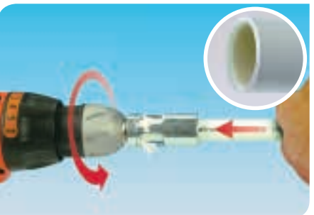
Use the Henco kalispeed for centreing the pipe and deburring the inner and outer edges of the pipe.