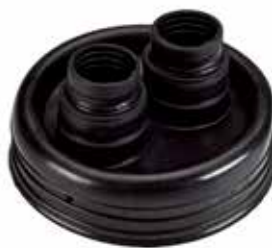
Rubber end cap

The rubber end caps create a watertight connection between the Henco multilayer pipe and the insulated jacket. Furthermore, the straight post-insulation set forms a watertight connection between two joined Henco Flex pipes.